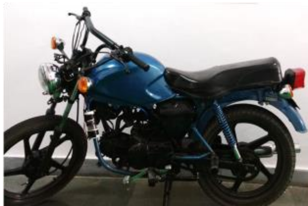
Figure 1: Bike under study with HHO Booster

Earlier specified HHO Booster was fitted in the motor bike under study with the help of clip holder near engine in front of Telescopic hydraulic shock absorbers which is clearly visible in figure 1.