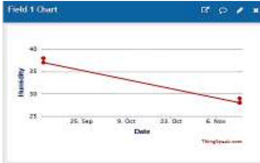
Fig 7.1 Graph of Humidity values

of data like numerical, string and few other data types. These channels can be created in the user's ThingSpeak account. So, Every time the data is uploaded to the cloud that means data is written into that particular channel created in the user's account. This stored data can be monitored continuously and also analysed using MATLAB Analytics in the platform for better understanding of the temperature and humidity levels in the locked cars.