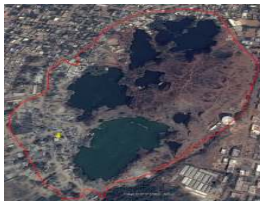
Figure 1. Sudsy area – Stone Quarry of Pammal region

and within 1km from Tambaram and Maduravoil Express high way (figure 1). The Tamil Nadu Pollution control board give the consent order to install the above industry and operation where monitored and look after the fulfillment of the Air, Noise, Water Soil Pollution control Measures were installed already and it is periodically inspected by the officials and renew the consent order every year.