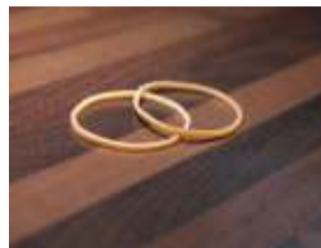
Figure 5: Synthetic Rubber Band

Synthetic rubber can also be recycled from automobile workshops as worn out inner tire tubes are readily available there and are of no use.