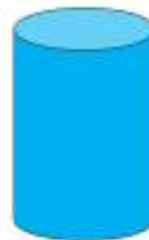
Figure 2: Cylindrical Solid Tube

The whole body of the instrument has been placed or been covered with a solid metallic tube which is cylindrical in shape. It has been successfully designed to bear all the heat and energy keeping in mind its heat bearing capacity.