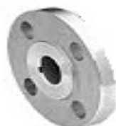
Figure 3: Valve

In between the cylindrical tube, a circular valve has been placed and fitted well. Its main purpose is to provide a base to the cracker so that it can experience the momentum at a good level for its proper execution.