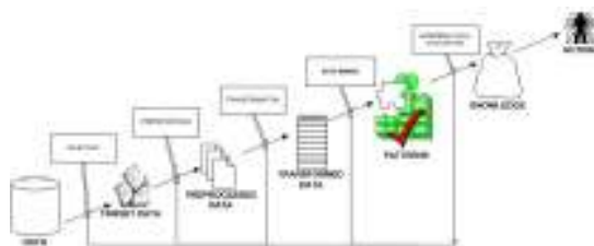
Figure 1 Awareness Data Mining

In the real world, huge amount of data are available in education, medical, industry and many other areas. Such data may provide awareness and information for decision making. For example, you can find out drop out student in any university, sales data in shopping database. Data can be analyzed, summarized, understand and meet to challenges.[1] Data mining is a powerful concept for data analysis and process of discovery interesting pattern from the huge amount of data, data stored in various databases such as data warehouse, world wide web, external sources. Interesting pattern that is easy to understand, unknown, valid, potential useful. Data mining is a type of sorting technique which is actually used to extract hidden patterns from large databases. The goals of data mining are fast retrieval of data or information, awareness Discovery from the databases, to identify hidden patterns and those patterns which are previously not explored, to reduce the level of complexity, time saving, etc[2]. Data mining refers extracting awareness and mining from large amount of data. Sometimes data mining treated as awareness discovery in database (KDD)[3]. KDD is an iterative process, consist a following step shown in Figure1 [4].