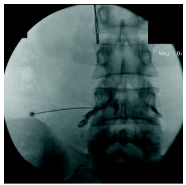
Figure 2: Safe Triangle (Radiograph)

In this study, 100 patients were included. 82 patients were treated with selective nerve root block and 18 patients treated with pulse radiofrequency, were followed for average 6 months. Maximum number of patients were found in age group of 31 to 40 years (41%). Mean age of our study is 41.7 years with male to female ratio is almost 1:1.