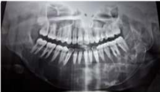
Figure 3: Panoramic radiograph (OPG) is showing the generalised multilocular radiolucency

Blood investigations, serum calcium, PTH level, serum phosphorus and alkaline phosphates levels were within the normal limits .