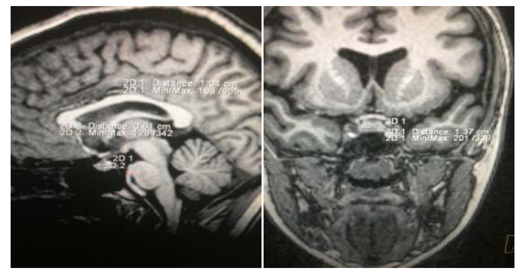
Figure 3a & 3b: Midline sagittal and coronal T1 weighted images showing various dimensions of pituitary gland in a 25 year old female with height of 8.1 mm with convex upper border

and 3b) and concave shape was seen in 14% in all age groups and both sexes.