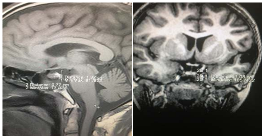
Figure 1a & 1b: Midline sagittal and coronal T1 weighted images showing height AP dimension and transverse dimension of pituitary gland in a 52 year old female with height of 7.7 mm

Mean and Standard deviations of pituitary height were calculated in the scale of mm. Volume in different age groups were calculated in the scale of mm3. Relation between mean height and age and relation between volume and age were done by ANOVA test, Chi-square test and pvalue <0.05 was considered as significant.