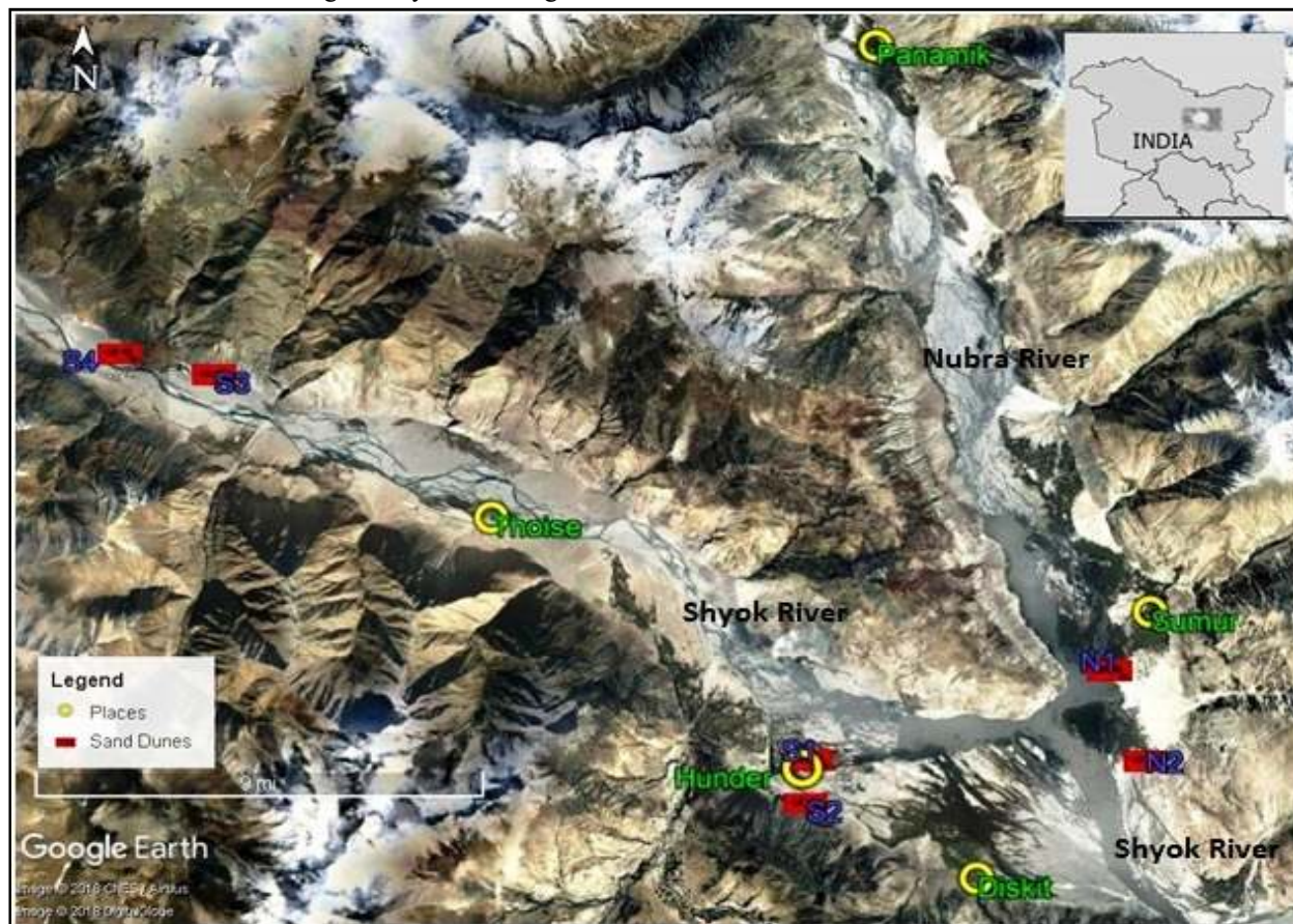
Figure 1: Location of Nubra and Shyok sand dunes on satellite image (Google Earth)

the Karakoram ranges from Leh. The Shyok River, a tributary of the Indus River, originates from the Rimo Glacier, one of the tongues of Siachen Glacier.