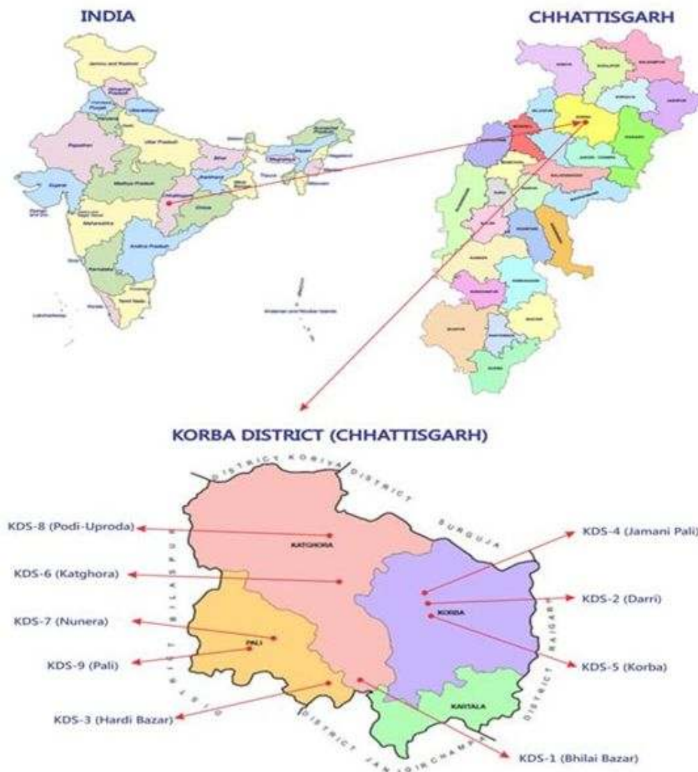
Figure 1: Map of Study Area (Korba District)

different surface water. The analytical results were interpreted by the statistical quality like Mean, SD, SE, %CV, r and SWQI.