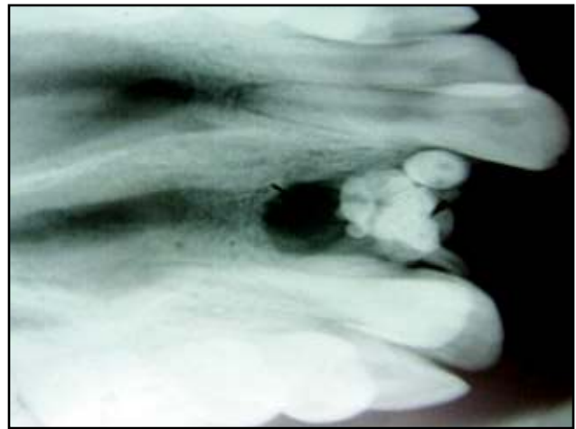
Figure 4 : Occlusal Radiograph