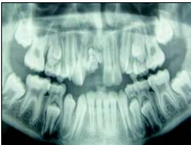
Figure 5 : Orthopantomographic View