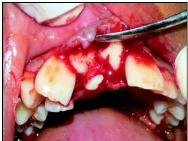
Figure 6 : A Mucoperiosteal Flap Was Raised Extending From Labial Aspect of Central Incisor on Left Side to the Distal of Right Canine.