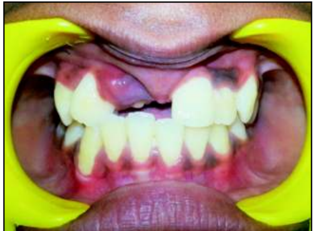
Figure 2 : Pre-Operative Photograph Front View