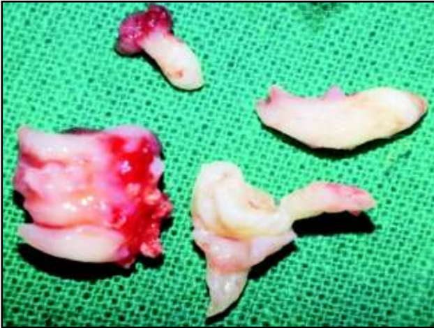
Figure 7 : Several Blocks of Odontoma Removed.