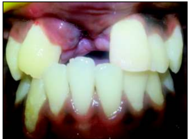
Figure 10 : Post-operative View After 1 Week

using a #6 spherical drill and a #704 tapered stem, and several blocks of odontoma were removed[Figure 7]. The surgical cavity was totally smoothed and no complementary treatment was found necessary. Mucoperiosteal flap was closed with interrupted sutures. Postoperative medication consisted of antibiotics and analgesics for 7 days.