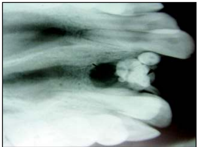
Figure 4 : Occlusal Radiograph