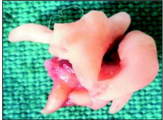
Figure 8 : The Excised Bony Masses Measuring Around 2.0x 1.5 X 1.0 Cm Sent For Histopathological Evaluation