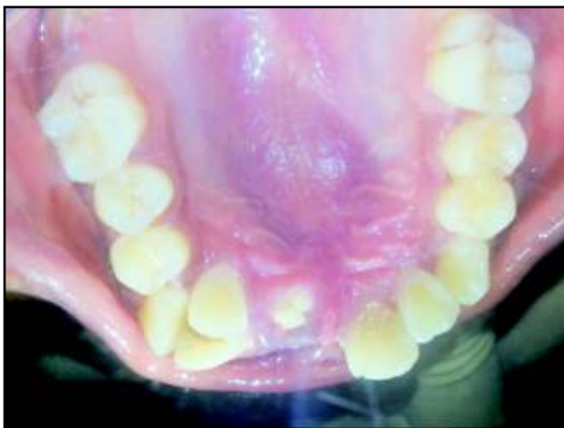
Figure 3 : Pre-Operative Photograph Intraoral View